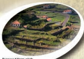
Terraced farm plots